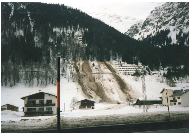
Figure 1. Muddy snow avalanches from forest triggered in march 1988 by rain after 38 cm snowfall within 3 days. Photo: K. Perzl, 1988.

Most avalanches that are perceived in Alpine settlement areas as coming from forested terrain originate from slopes or canyon heads above the current timberline or from currently open areas [15]. Nevertheless, forests on steep mountain slopes should never be considered as areas not prone to avalanche formation [16]. The basic avalanche release susceptibility of forested slopes in the Alps is not evident in hazard and damage statistics, as it is masked by the protective effect of the mainly dense woody vegetation and by artificial snow supporting structures which already have been established at the beginning of the 20th century in forests with high protective functions and low protective effects [7].