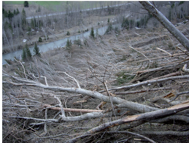
Figure 4. Destruction of a young deciduous forest by an avalanche.