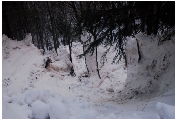
Figure 5. Detrainment of avalanche snow by trees.

surface roughness on short-slopes and to promoting stand stability by species selection, formation of resistant individuals and acceptance of shrub-dominated growth.