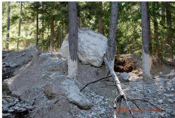
Figure 7. Detrainment of coarse debris from a debris flow by forest at the alluvial fan. Photo: F. Perzl, 2012.

Trees and coarse woody debris can retain mobilized sediments and therefore reduce hillslope and torrential debris flows [75–79]. Large-scale datasets indicate lower frequencies [80] and runout lengths [81] of debris flows and debris avalanches in mature forests in relation to other land uses or clear-cuts and young forest. However, the reduction of runout lengths may be an effect of smaller landslide densities and erosion volumes in mature forests rather than a barrier effect [76]. Results of [78] indicate a higher potential of trees and logs to retain debris at low-order section of rivers than on alluvial fans. Detrainment of debris on alluvial fans by forest depends on sediment concentration and tree density [82]. Trees increase the flow resistance and favor the deposition of materials due to detrainment of (coarse) debris, but the protective effect is difficult to assess ( Figure 7 ).